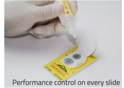
Performance control on every slide