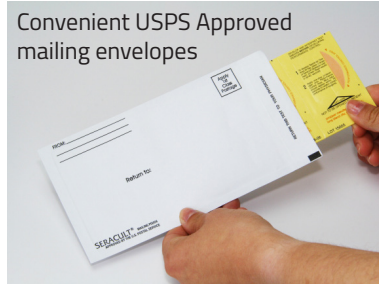
Convenient USPS Approved mailing envelopes